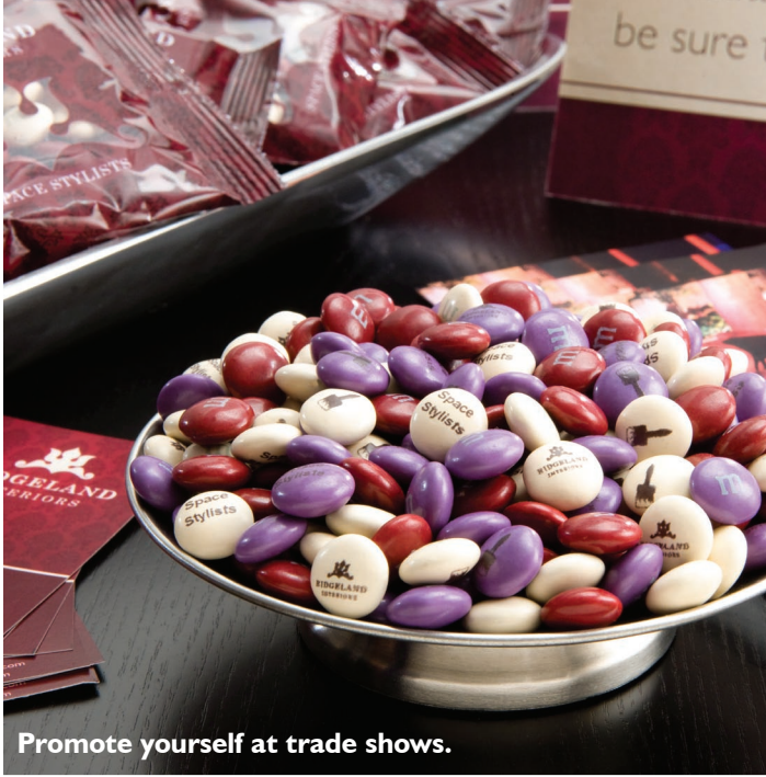
Promote yourself at trade shows.