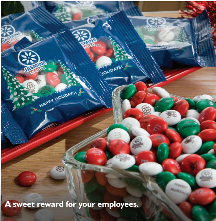
A sweet reward for your employees.