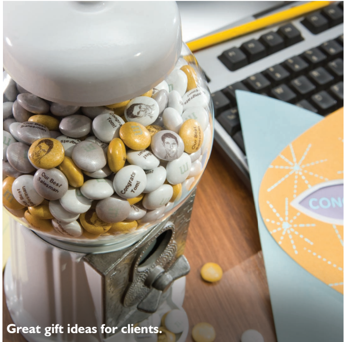
Great gift ideas for clients.